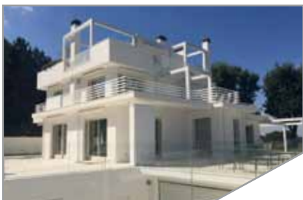
07_Private villa - Senigallia (AN)