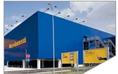
15_IKEA - Chieti store