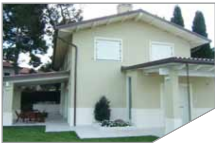
01_Private villa - Province of Pesaro and Urbino