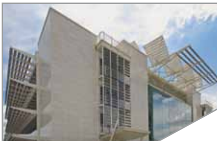
16_Federazione BCC Marche - Ancona