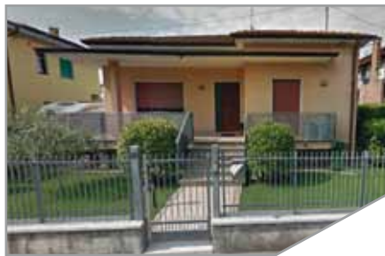
02_Appart. weak user - Sassari