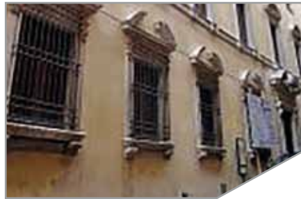
14_Podesti Gallery - Ancona