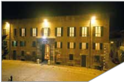
13_Civic Museums - Pesaro