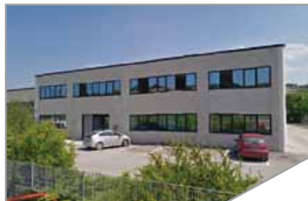
17_Ethica - Trecastelli (AN)