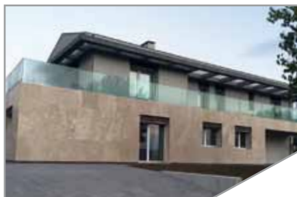
08_Private villa - Province of Ancona