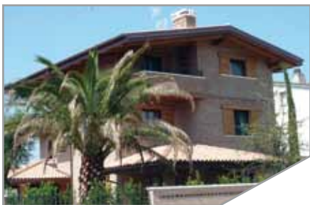
04_Private villa - Fano (PU)