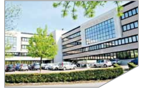
12_Office building - Ancona