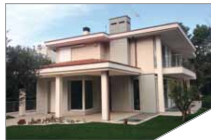
06_Private villa - Fano (PU)