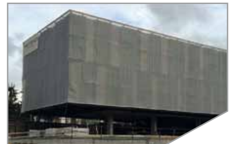
18_Asset Banca - Gualdicciolo (RSM)