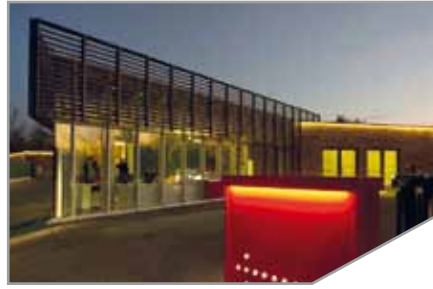
11_Motel Camelia - Novara