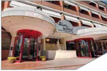
10_Hotel dei Nani - Jesi (AN)