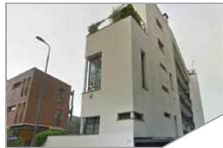
03_Loft - Milan