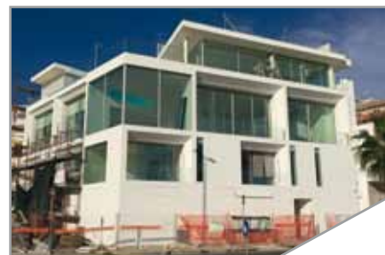
09_Private villa - Gallipoli (LE)