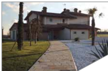
05_Private villa - Mondolfo (PU)